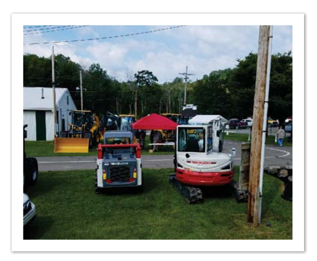
The 2017 Tioga/Bradford Equipment Show at the Troy Fairgrounds